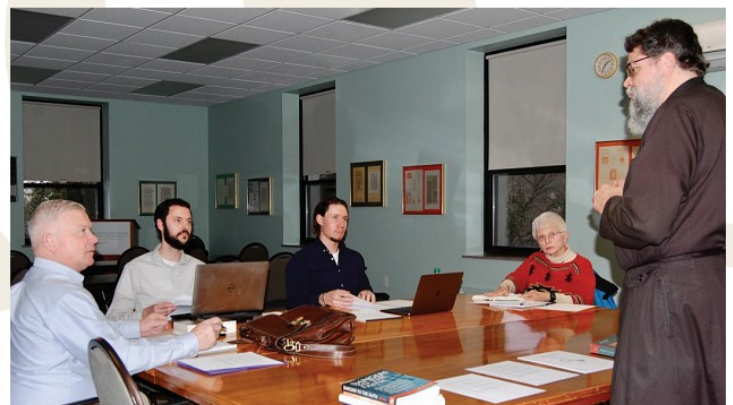
Students at the Byzantine Catholic Seminary include seminarians, lay men, and lay women.