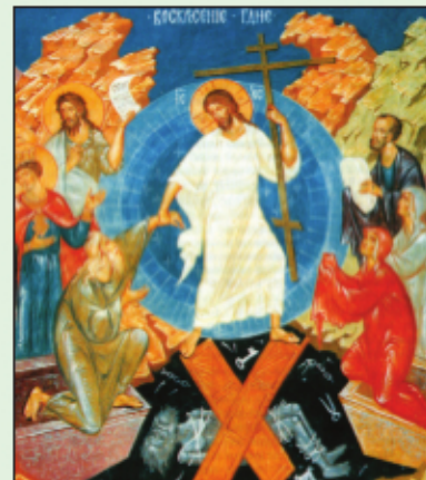
Blessed Pascha from the Seminary.