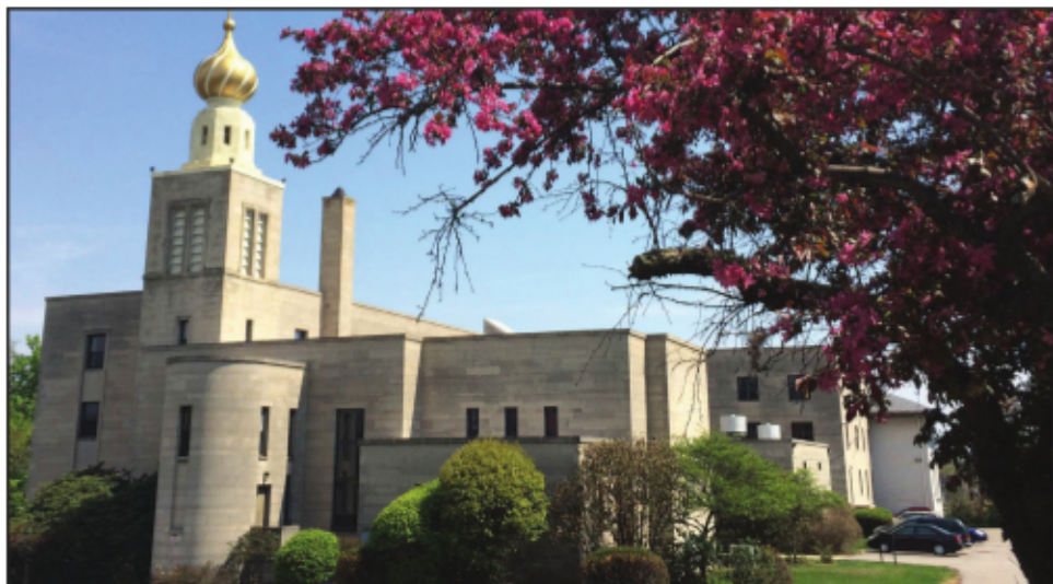
Spring at the Seminary filled with hope for the success of new programs.

Earlier this year, the Byzantine Catholic Seminary of Ss. Cyril and Methodius, Pittsburgh, PA announced Continuing Education and Pastoral Formation Opportunities for Clergy. These unique opportunities are as follows: