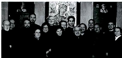
Some of the faculty, seminarians and MAT students at the Seminary

The Byzantine Catholic Seminary of SS Cyril and Methodius has been granted accreditation by the Commission on Accrediting of The Association of Theological Schools (ATS) at their meeting in January 2008.